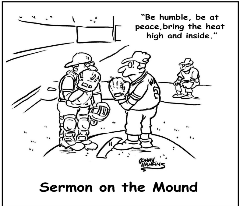
Sermon on the Mound